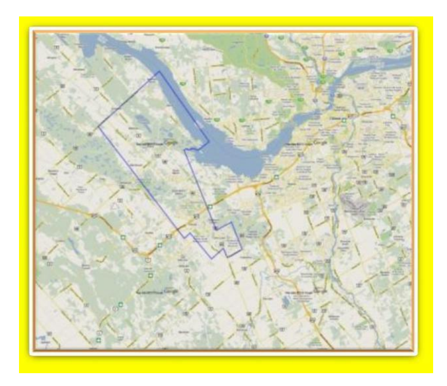
Figure 6 - HEO District 11 (KMHA) Geographic Boundary

6. Boundaries . The following map represents the District 11 Boundaries set out by HEO Minor. <u>http://maps.odmha.on.ca/aba/region/17</u>