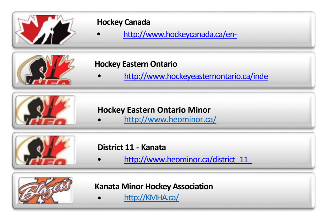
Figure 2 - KMHA Minor Hockey Affiliations

The KMHA and the Minor Hockey Affiliations. In accordance with KMHA By-laws and Governance, the corporation shall be a member of the following organizations: (a) Hockey of Eastern Ontario Minor; (b) Hockey Eastern Ontario (HEO) and (c) Hockey Canada.