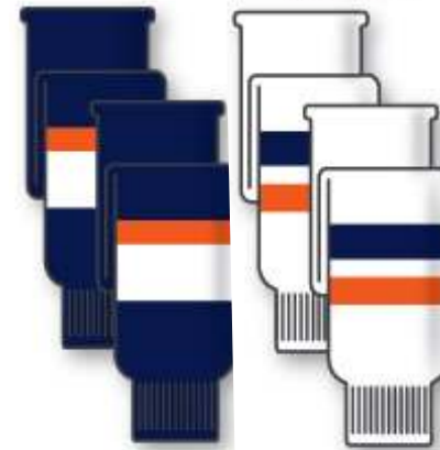
Conventional Knit Socks